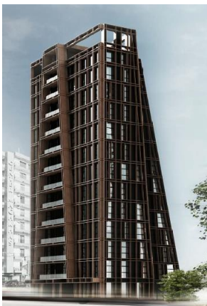
LE GRAY D'LBION DGM 38