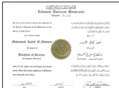
Bachelor in Computer Science