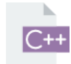
Java, C, C++, C#, VBA, VB.NET, Python