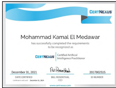
Certified Artificial Intelligence Practitioner