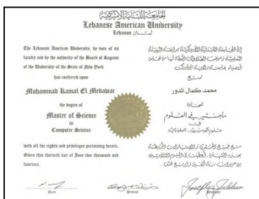
Masters in Computer Science