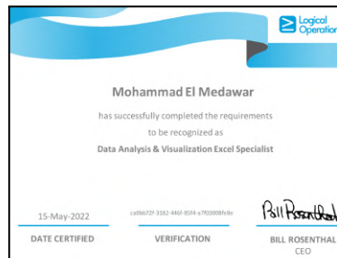
Data Analysis and Visualization Specialist