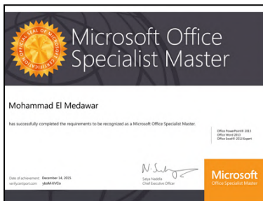
Microsoft Office Specialist Master