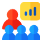
Presentation Skills With Microsoft PowerPoint