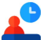
Time Management With Microsoft Outlook