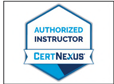
CertNexus Authorized Instructor