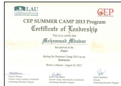
Certificate of Leadership