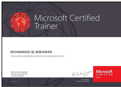
Microsoft Certified Trainer