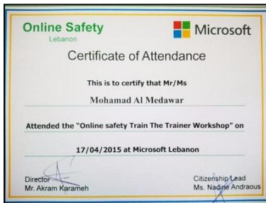
Train The Trainer Online Safety